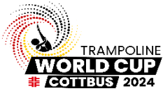
FIG Trampoline Gymnastics World Cup 22- 24 March 2024, Cottbus (GER)