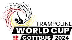
FIG Trampoline Gymnastics World Cup 22- 24 March 2024, Cottbus (GER)