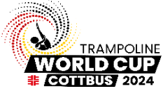
FIG Trampoline Gymnastics World Cup 22- 24 March 2024, Cottbus (GER)